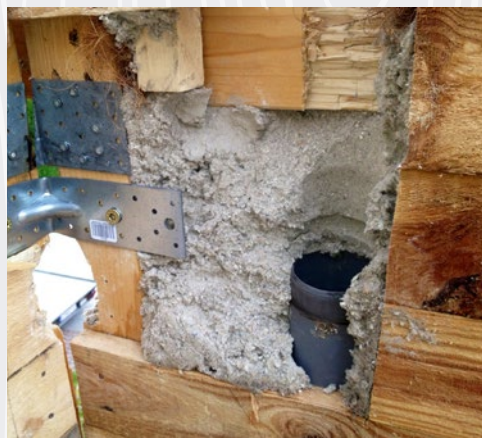
The cellulose installed as insulation in the exterior and partition walls showed no signs of settling or deformation.