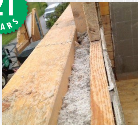
The prefabricated house is demolished after 21 years. (Lower Austria / Wr. Neustadt).