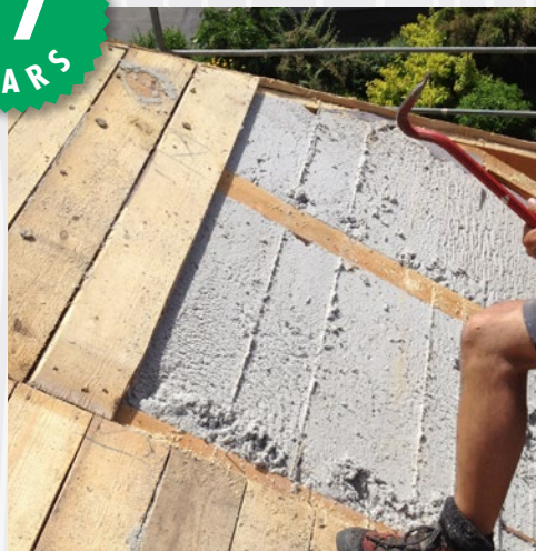
Attic opened after 17 years (house in Tyrol); The ISOCELL cellulose looks like it's just been blown in.