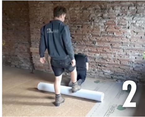
Then roll up again neatly