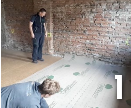
Roll out and adjust TIMBER PROTECT