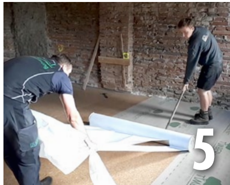
At the same time, smooth out the sheet with a squeegee. Always work towards the end of the sheet to avoid air bubbles and creases.