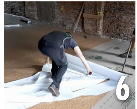
As soon as the backing strip can no longer be handled without creasing, cut off and peel off the backing strip at the short end.