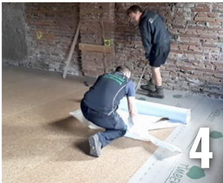
Pull off the backing strip. IMPORTANT: The roll must be rolled out and lying on the ground while the backing strip is peeled off.