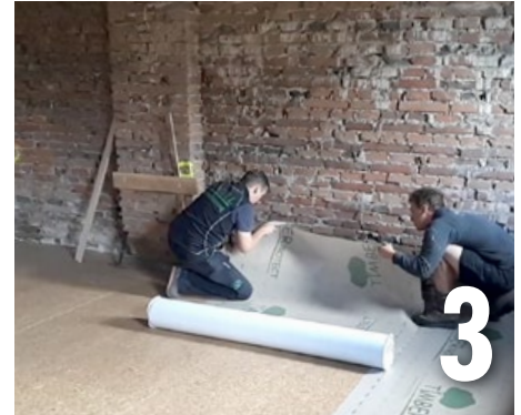
Peel off the backing strip at the start of the roll and fix TIMBER PROTECT in place