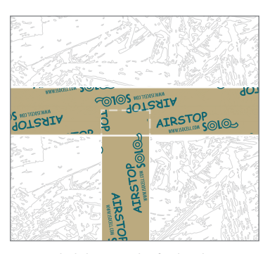
Loose end (below) can be fixed with continuous AIRSTOP SOLO Adhesive Tape.