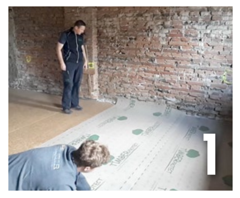
Roll out and adjust TIMBER PROTECT