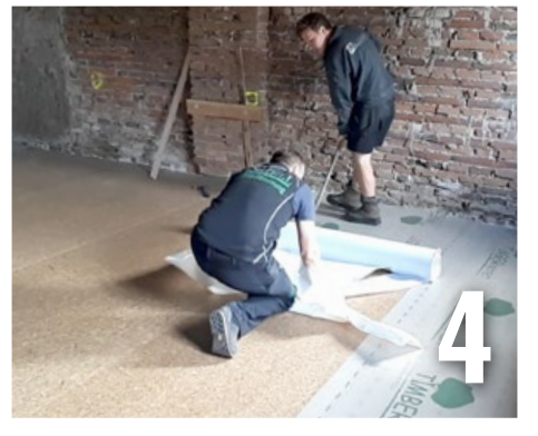
Pull off the backing strip. IMPORTANT: The roll must be rolled out and lying on the ground while the backing strip is peeled off.