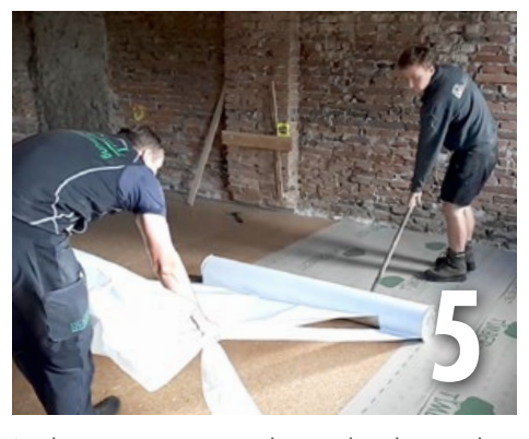
At the same time, smooth out the sheet with a squeegee. Always work towards the end of the sheet to avoid air bubbles and creases.