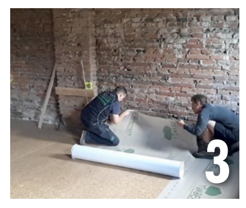
Peel off the backing strip at the start of the roll and fix TIMBER PROTECT in place