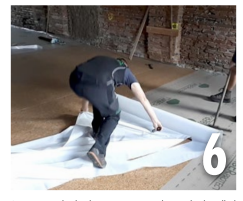
As soon as the backing strip can no longer be handled without creasing, cut off and peel off the backing strip at the short end.