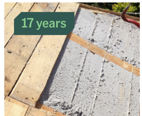
After 17 years with the roof structure opened: ISOCELL cellulose appears as if freshly blown in – no signs of settlement or deformation.

tion looked as if it had just been blown in. That is impressive when you consider how other insulation materials often look after only a few years." Another example of the durability and dimensional stability of ISOCELL cellulose was observed during the attic conversion of a single-family house in Tyrol in spring 2014 that had been insulated 17 years earlier. Here too, the workers found an intact, seamless insulation layer.