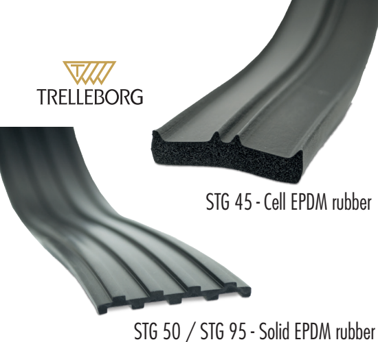
STG 45 - Cell EPDM rubber